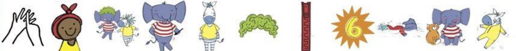
kid jig hip Fin wig zip six swim sit slip