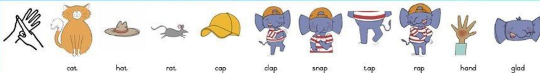
cat hat rat cap clap snap tap rap hand glad