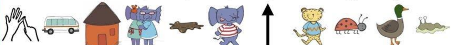
bus hut hug mud run up Bud bug duck slug