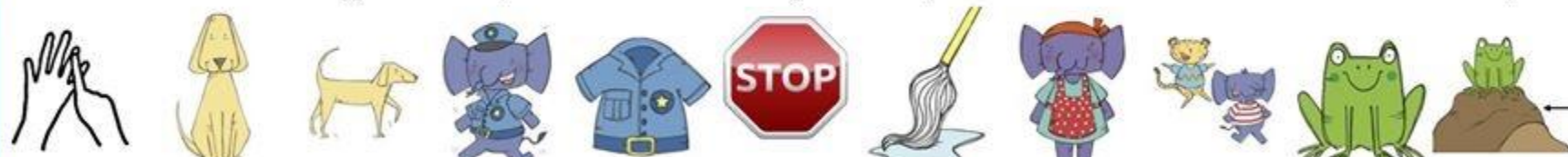
Bob dog cop top stop mop mom jog frog rock