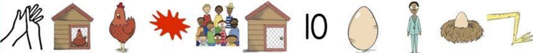
pen hen red men den ten egg vet nest leg